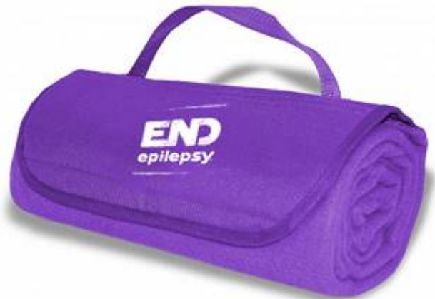
Size: 47" x 53"

Who is recognized? ANYONE who is registered to attend the Walk to End Epilepsy on Sunday, November 5, 2017. You can be a team member, captain of a team, or participating without any team affiliation. Gifts are awarded based upon meeting the fundraising levels of $100-$249 or $250+.