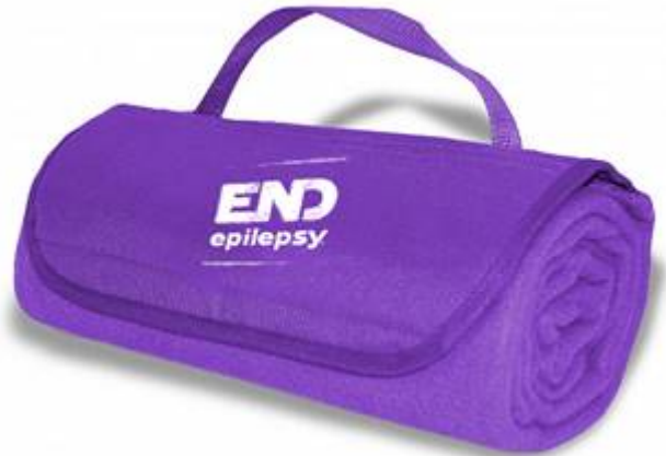
Size: 47" x 53"

Who is recognized? ANYONE who is registered to attend the Walk to End Epilepsy on Sunday, November 5, 2017. You can be a team member, captain of a team, or participating without any team affiliation. Gifts are awarded based upon meeting the fundraising levels of $100-$249 or $250+.